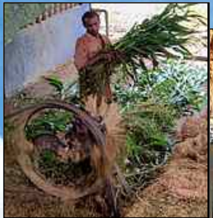
Cow food is stored safely on the second floor of the cowshed. All the grass needed is grown in our own fields.